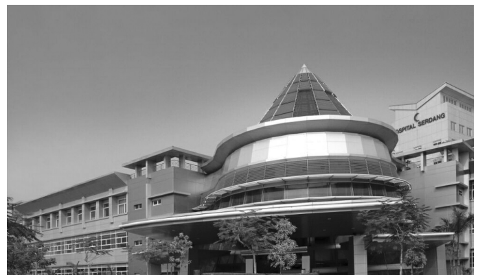
Figure. Hospital Serdang, located in Selangor, Malaysia is approximately 15 miles from the Malaysian capitol of Kuala Lumpur.

Our team had to respond within 12 hours by order of our National security council. We had several roadblocks and issues. First the disaster occurred over the holidays and many staff members were on leave. The majority of medical personnel did not have a valid passport. I had to coordinate mobilizing medical personnel from various hospitals had to receive vaccines prior to deployment. We had inadequate supplies of equipment and medications, and all vendors were closed for the holidays. Deployment briefing had to be done at airport and on the plane. However, post deployment post mortem was done which included psychological assessment.